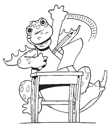
Quiet hands up in class